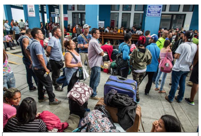
Hundreds of Venezuelans queue at the Binational Border Assistance Center (CEBAF by its Spanish acronym) waiting to enter Peru