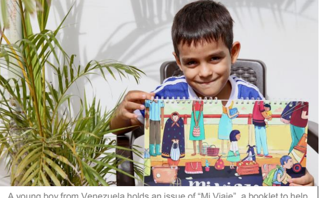
A young boy from Venezuela holds an issue of "Mi Viaje", a booklet to help young Venezuelans through their journey

UNHCR, as part of its work with community organizations in the border town of Arauca launched "Mi Viaje" ("My Trip"), an activity and coloring booklet designed for Venezuelan children so that they can better understand and express their views about their journey from Venezuela to Colombia.