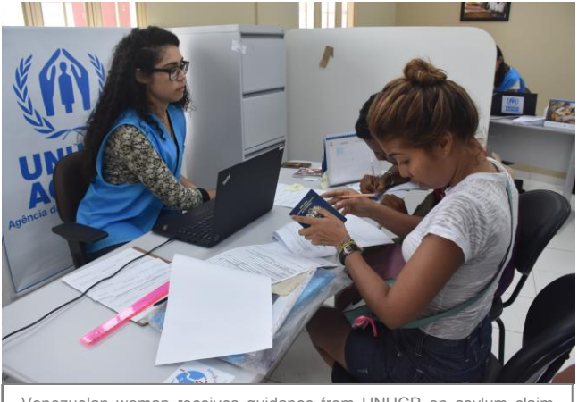
Venezuelan woman receives guidance from UNHCR on asylum claim procedures at the Reference Center for Refugees and Migrants, in Boa Vista.

between Brazil and Venezuela (by the city of Pacaraima) is registering an average of 600-700 entries per day. Up to 7,000 people in Roraima are currently in need of emergency shelter assistance.