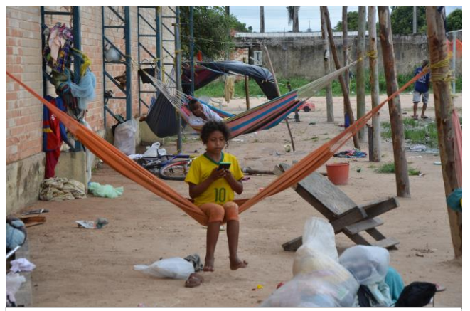
Venezuelans rest outside the shelter in the Boa Vista border city in Roraima state, Brazil. The indigenous Warao prefer sleeping in hammocks, so some have set up their spaces outside the shelter's walls. UNHCR has been working with authorities and partners to establish better living conditions, including access to clean water and medical services.