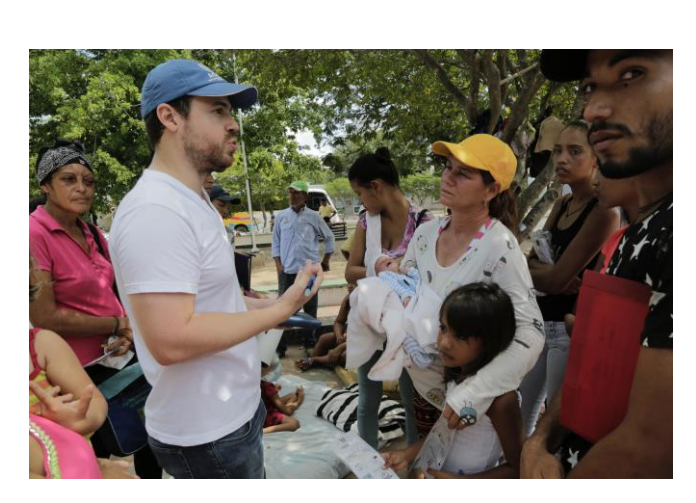
Many Venezuelans arriving in neighbouring countries are in need of protection and shelter, UNHCR is providing assistance and working together with Governments to develop a comprehensive response.