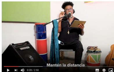
Sácale Lo Pie music video. Watch here

In 2020, some positive steps in advocating for the integration of Venezuelans took place and were met with excellent responses. All Caribbean countries engaged in a series of festivals to mark World Refugee Day 2020. Some celebrations included music concerts, art expositions, bilingual story telling activities and screenings of films, with the purpose of promoting commonalities, nudging changes in perspectives and ultimately fostering integration through social activities.