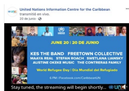
2020 World Refugee Day concert. Watch here

In 2021, in Guyana, one partner started collaborating with a Cuban radio program host where discussions revolve around various topics on displacement and integration. The objective is to bring Venezuelan refugees and migrants, Guyanese, and returnees to discuss specific topics, including cultural views. R4V partners will participate in the discussion to bring awareness about xenophobia and more.