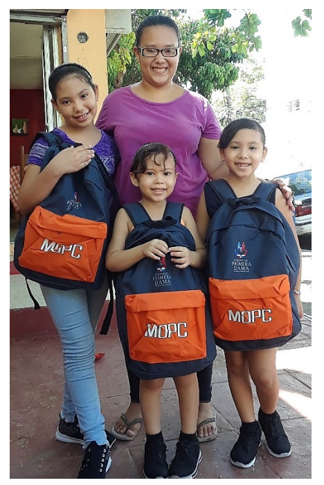
Dominican Republic R4V partners distribute Education kits in 2020

Within the 'Equal Place' educational program in Trinidad and Tobago, uptake for online services grew by 49% as the number of children served moved from 600 to 1,235 children. Online services also enabled more stable attendance, with about 1,022 students attending regularly. Equal Place also created employment opportunities for 40 facilitators, from both the refugee/migrant and host populations. Before the onset of COVID-19 measures, approximately 540 of the aforementioned students attended classes at physical spaces provided by partners. During the lockdown, with Equal Place switching to a fully online modality, R4V partners worked to ease the digital gap and distributed approximately 1,100 tablets for use at home, so learners could participate in online classes.<sup>6</sup> 31 teachers were also given devices to ensure they could support learners. Additionally, R4V advocacy efforts led to the Catholic Education Board of Management offering spaces to Venezuelan children registered during the Government's registry efforts in June 2019. While waiting for the final approval of the Ministry of National Security, the Catholic Education Board of Management identified 140