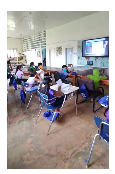
School in Mabaruma, Guyana

In addition, R4V partners supported the production of hammocks and selling of face masks as a source of income for vulnerable Venezuelan refugees and migrants.